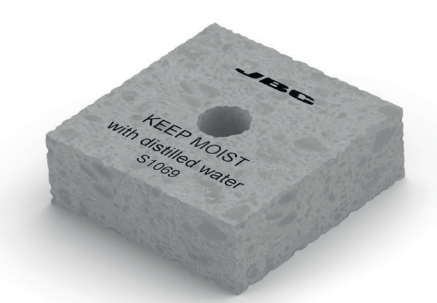
$1069 Sponge 46 x 46mm