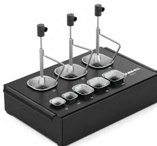
included in ESHT Magazine for Protectors & Extractors