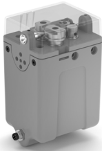
Solder Feeder for Robot ..... 1 unit Ref. SFR-B