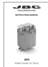
Manual ..... 1 unit Ref. 0027875