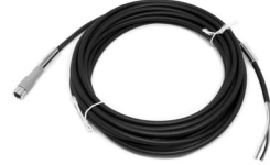
Communications Cable 3 m ..... 1 unit Ref. 0024563