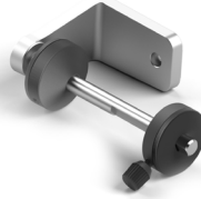
Reel Support ..... 1 unit Ref. 0024561