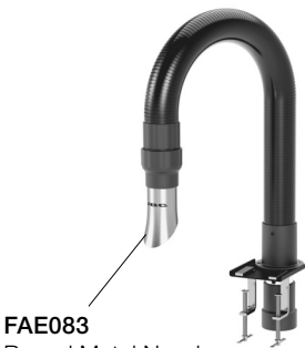
FAE083 Round Metal Nozzle

The cable and the adapter are required to connect Compact stations with version "E" and previous to FAE1.