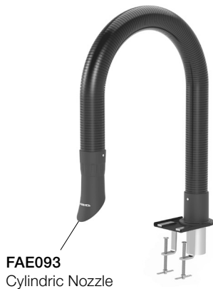
FAE093 Cylindric Nozzle

The cable and the adapter are required to connect Compact stations with version "E" and previous to FAE1.