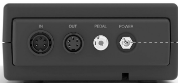
MSE Electric Desoldering Module