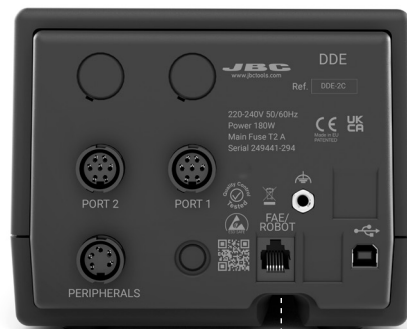
DDE 2-Tool Control Unit