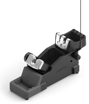
Stand ...... 1 unit Ref. DN-SF