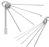
Tip Cleaning Rods ..... 1 unit Ref. CL5970