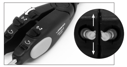
The tail wheel guarantees that the cartridges are equally aligned with vertical symmetry.

(!) Once the alignment has been made, do not forget to fix the cartridges by tightening the fixing knobs. A single turn of the knob is required to get them fixed.