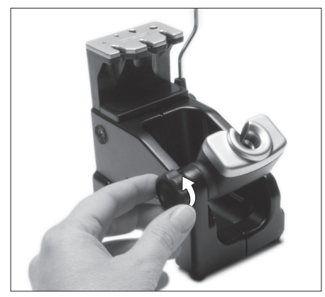
1 Turn the knob counterclockwise until it loosen.