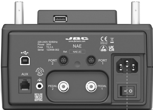
NAE 2-Tool Nano Control Unit