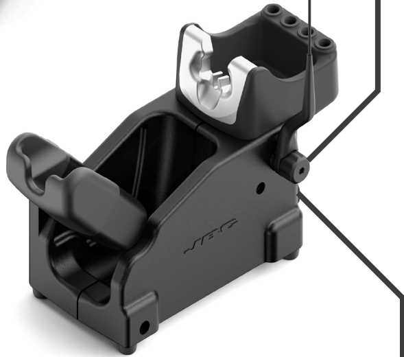
WSBT Stand for WS440