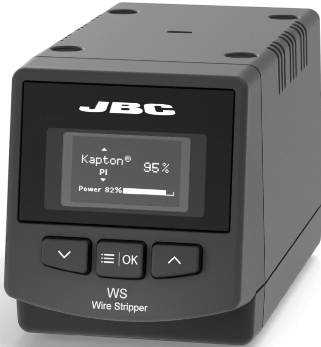
WS High-Temperature Wire Stripper Control Unit