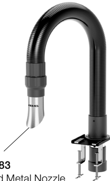
FAE083 Round Metal Nozzle

Flexible Hose ø50 mm ..... 2 units Ref. FAE010