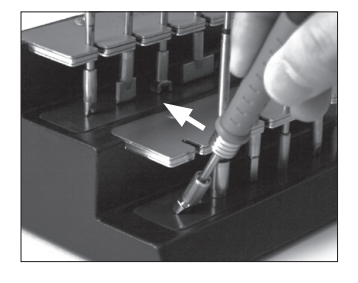
Place the cartridge in the slot as shown and pull to remove it.