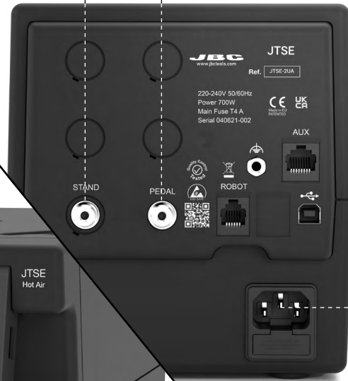
To P405 Pedal