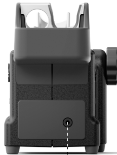
JTS Stand for JTT Heater Hose Set