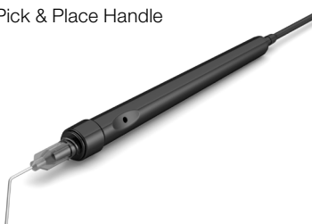
T260 Pick & Place Handle