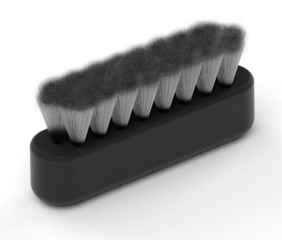
CL6217 Metal Brush for Compact Stations & Manual Tip Cleaner