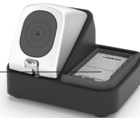
CL Manual Tip Cleaner