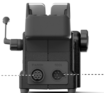
HDS Stand for T470 Heavy Duty Handles