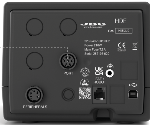
HDE Heavy Duty Control Unit