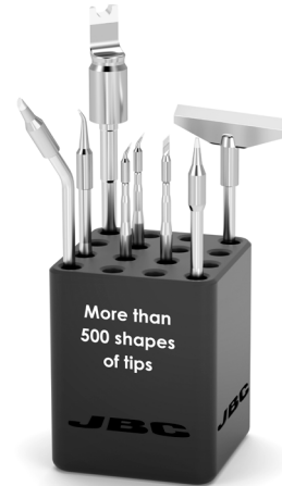
SCH Cartridge Holder